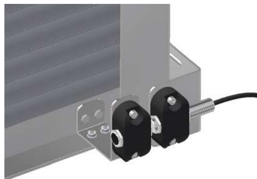
Brackets required to fit to Uninsulated Roller Shutter Door